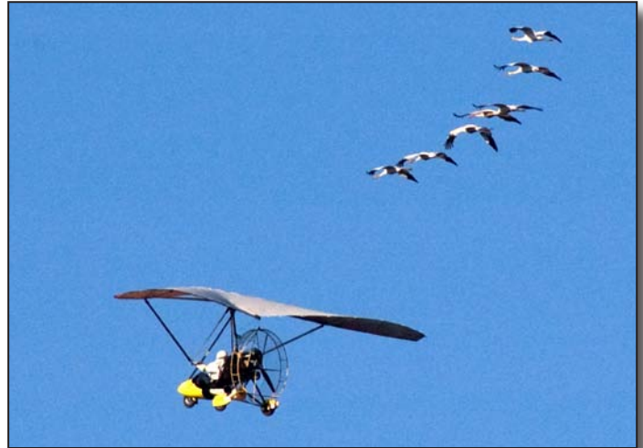
Whooping Cranes and ultralight over St. Marks January 17, 2009