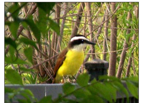
A Kiskadee perched on a fence. See the rest of Bill's photos on page 6. (Online edition only)

On the Upper Rio Grande trip, we found all three species of local orioles (Hooded, Altamira and Audubon's) within 10 minutes. We also saw all three species of kingfishers (ringed, belted and green), dozens of Neotropic Cormorants, three Gray Hawks, and many of the above endemics.