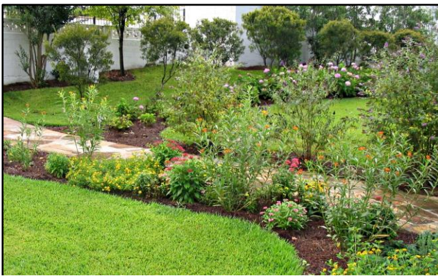
Radium Springs Monarch Pollinator Garden