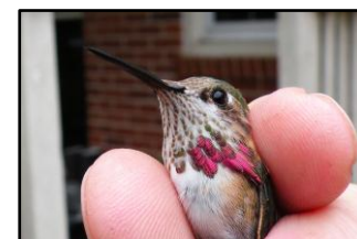
Young Male Calliope