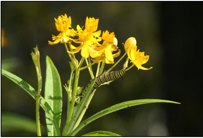
Radium Springs Monarch Pollinator Garden ~ Oct. 23, 2012