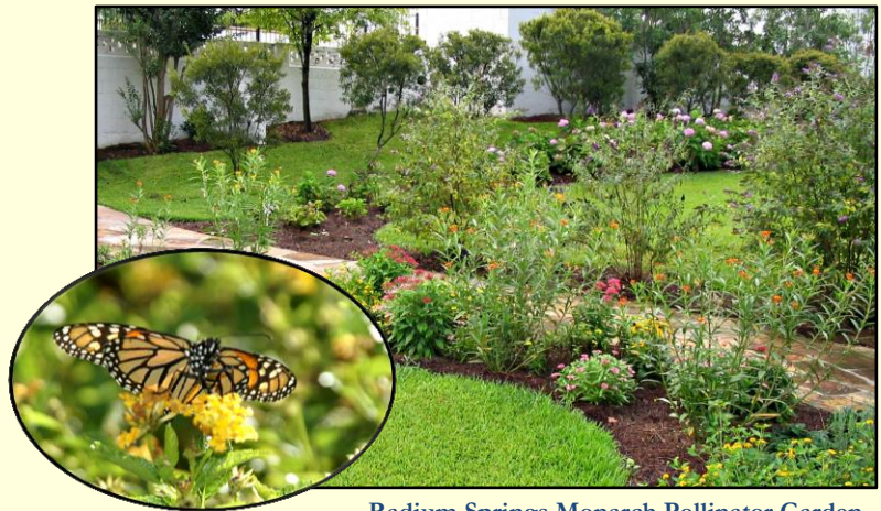
Radium Springs Monarch Pollinator Garden Monarch Butterfly

When the third annual AAS Wildlife-Friendly Yards Tour was held on February 20, 2010, no one could have guessed that one of the far-reaching consequences would be an award-winning Monarch Pollinator Garden at Radium Springs in Albany, Georgia.