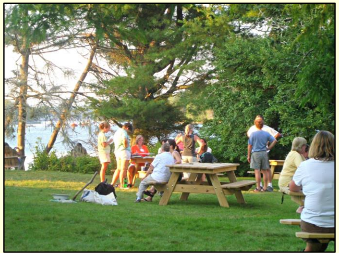
Relaxing & Getting Acquainted

Each day was filled with the routine of breakfast, workshop or trip, lunch, workshop, dinner, and evening programs where everyone would meet for informative speakers and historic or scientific discussions. On the first evening we all became introduced and learned a great deal about the history of Hog Island, http://hogisland.audubon.org/legacy-hog-island , and its importance in the conservation and ecology movement. We were divided into 4 groups for the daily workshop activities which were rotated all week long.