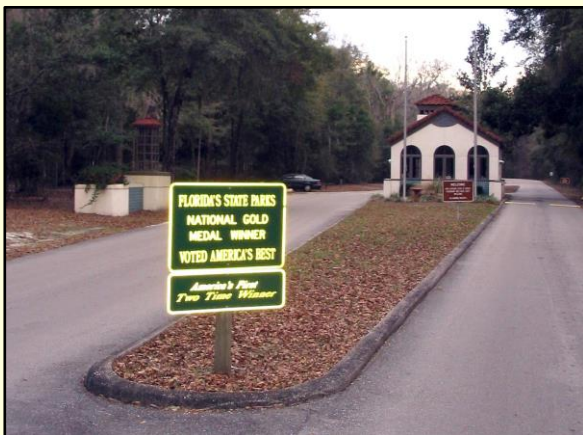
Wakulla Springs State Park Entrance